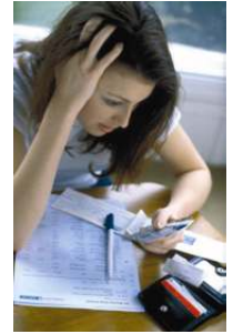
The Indian colleges seem to be stressing their students much more than their US counterparts.

So, should the Indian universities think about changing it's schedule? I think it's time they have a look at it as activities other than studies also help students for their future. Let's hope something is done and fast.