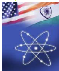
The Nuclear Deal between India and the United States will finally proceed ahead after the UPA government won the trust vote.